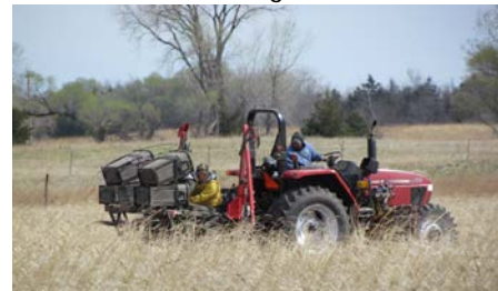
(continued on back)

To protect property and to encourage tree planting, the Lower Niobrara NRD makes low cost conservation tree and shrub seedlings available to District residents. Over the past five years the District has planted an average of 26,300 trees per year. Trees are planted in windbreaks for livestock and homestead protection, prevention of soil erosion, wildlife habitat, as "living snow fences"